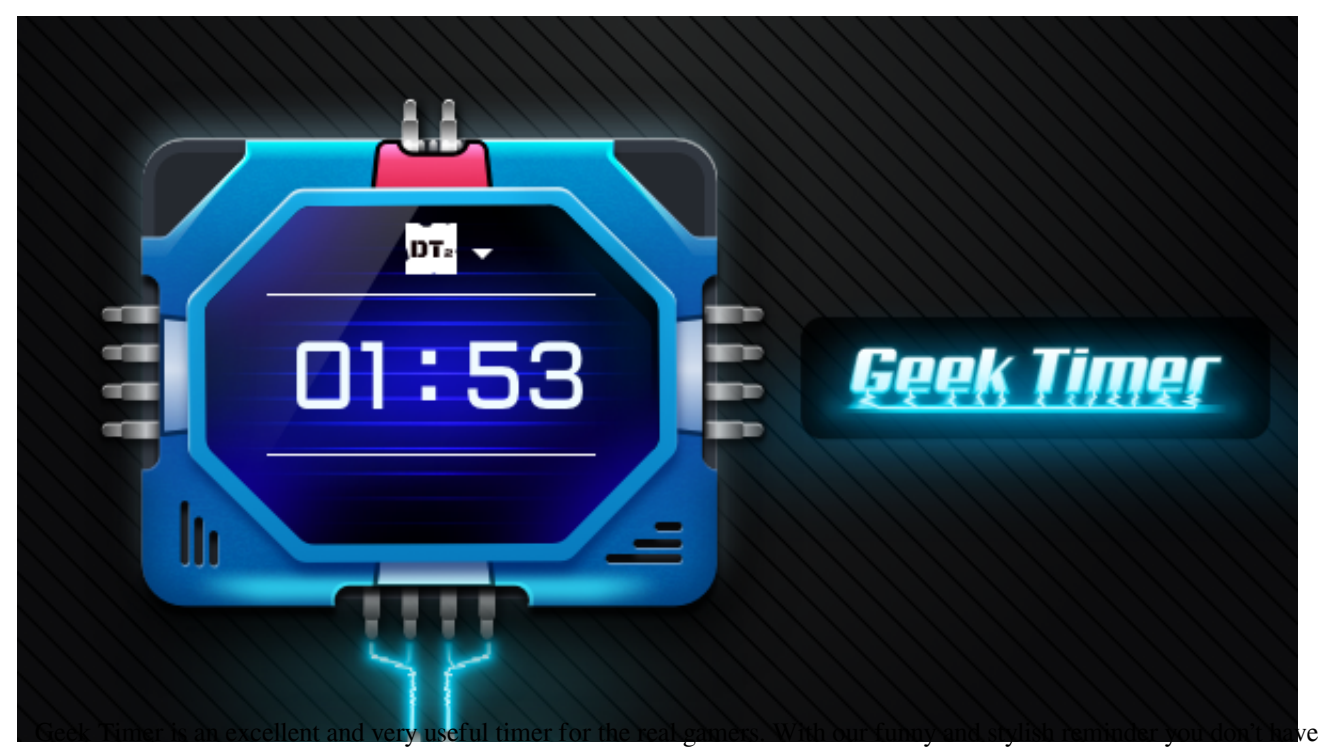
worry that you forgot to do something important during the game.

This timer will remind you of the most significant things while you're playing: time of game update, time until the game with your friends or time until Steam sale). It also will help you not to forget to pull out the tea bag, go to the toilet, do physical exercises, feed your lovely cat and do other things in real life.